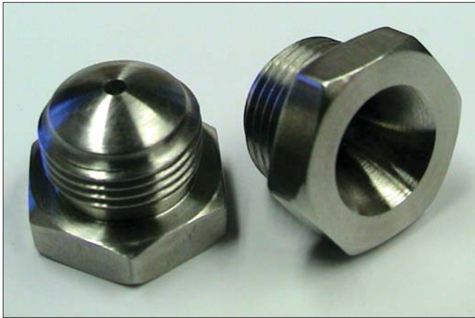
A typical felt/wire high pressure needle jet nozzle with white sapphire orifice.

If you see anything other than the edge of the orifice there has to be either debris present or perhaps a physical problem with the orifice.