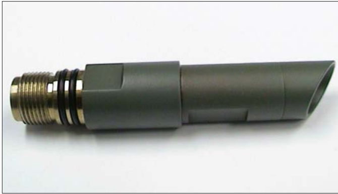
A high performance anti-stick coated trim squirt nozzle with dual sapphire orifices.